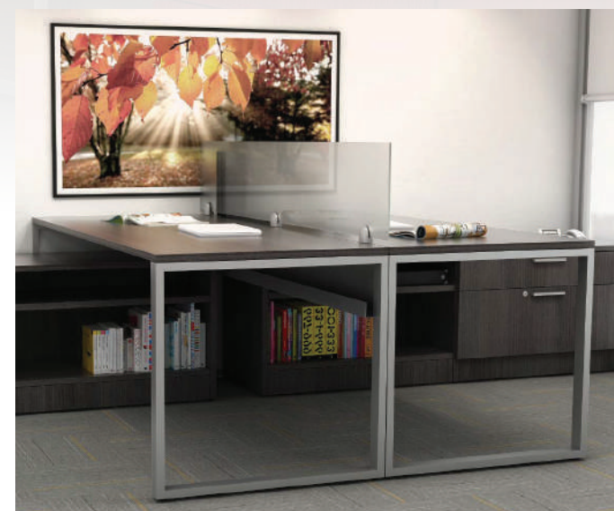
Graphite Wood / Nickel Rail Pulls