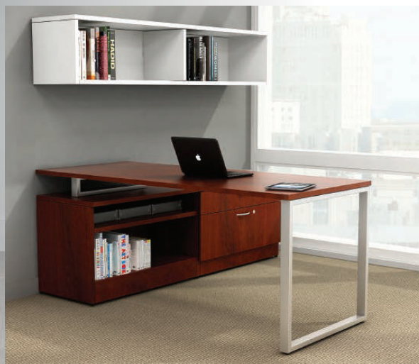
Shiraz Cherry & White / Silver Straight Pulls