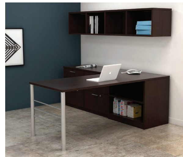
Chocolate Pear / Silver Straight Pulls