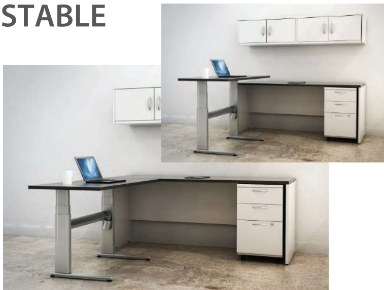
Tuxedo & White

Ergonomic experts everywhere agree the option of a sit-stand can make individuals more productive and efficient over long periods. Giving your staff the tools they need to be successful includes providing a comfortable and creative work environment.