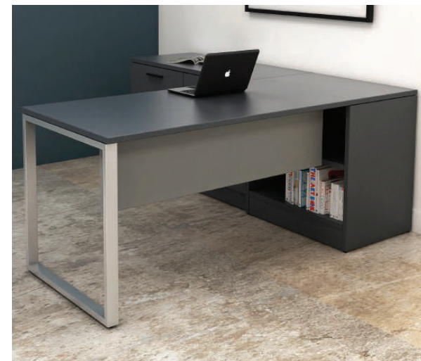
Charcoal / Black Rail Pulls