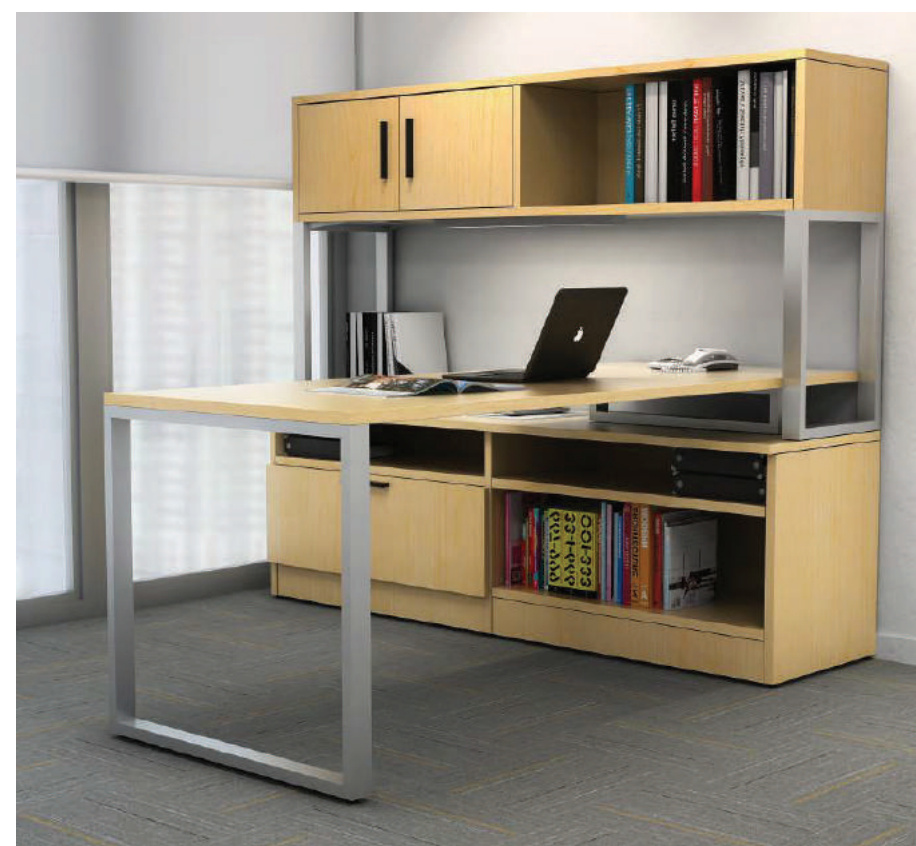
Natural Maple / Black Rail Pull