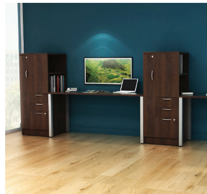
Chocolate Pear / Silver Straight Pulls