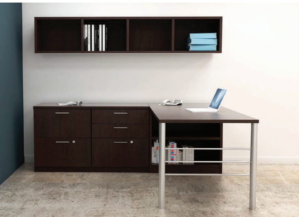
Chocolate Pear / Nickel Bar Pulls

The image on the left portrays a floating, open-style hutch, mixed lateral storage and a work surface supported by our contemporary H Leg. While the image on the right uses the same foot print as the left, we designed the workstation using sleek hutch supported O-Legs and modern square post legs.