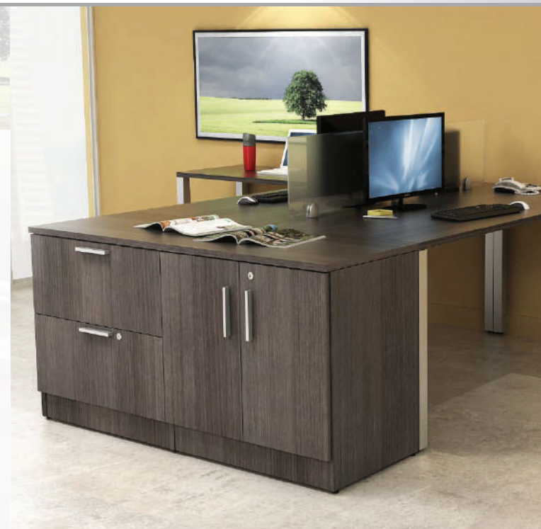
Graphite Wood / Nickel Rail Pulls