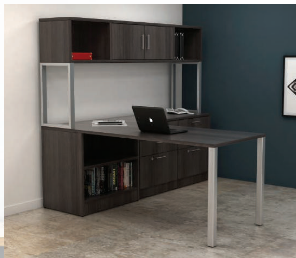
Graphite Wood / Nickel Bar Pulls