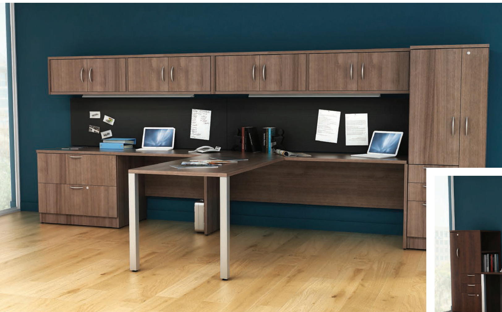
Copa Cabana / Silver Straight Pulls