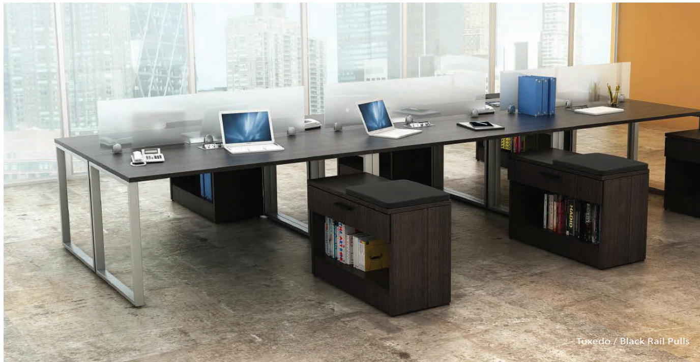
Tuxedo / Black Rail Pulls