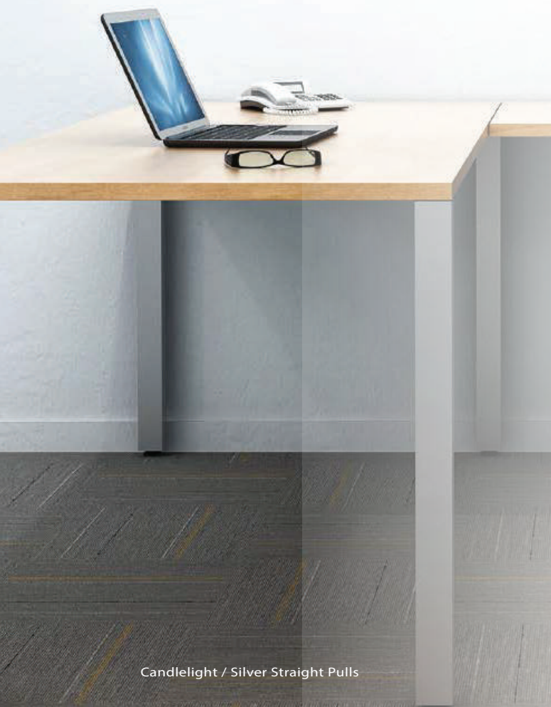
Candlelight / Silver Straight Pulls