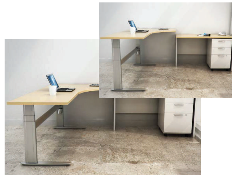
Maple & White